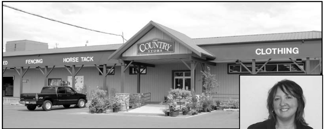
Lynden Country Store