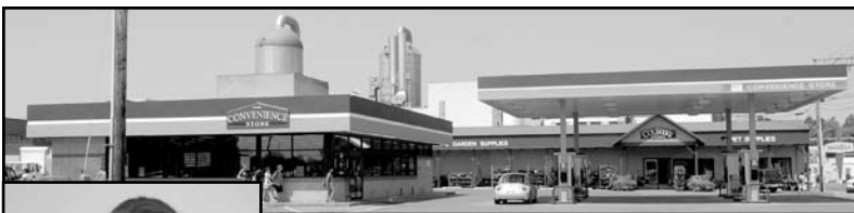
Lynden's WFC Convenience Store